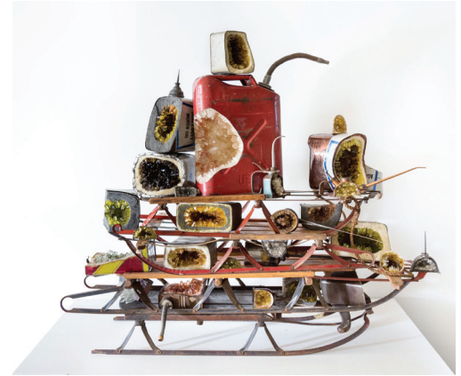
Mia Feuer, Canadian, born 1981, Totems of the Anthropocene , 2018, found sleds, found petroliana, individually cast and assembled polyester resin crystals, Purchase in Memory of David Schafer, 2024.10, © Mia Feuer

Totems of the Anthropocene was created using Feuer's personal collection of "petroliana" (petroleum-related collectibles) where vessels that once held oil and gas now hold synthetic crystals made from petroleum by-products. These sparkling geodes symbolize the allure and corrosive impact of petroleum use. The term "Anthropocene" describes our current geologic era—from the Industrial Revolution to now—marked by human activity's irrevocable impact on our ecosystem.